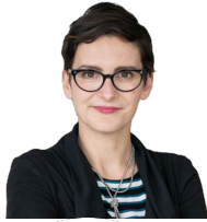
Chief Data, AI Technology and Finance Officers