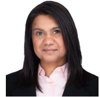
Chief Customer, Revenue and Business Development Officers